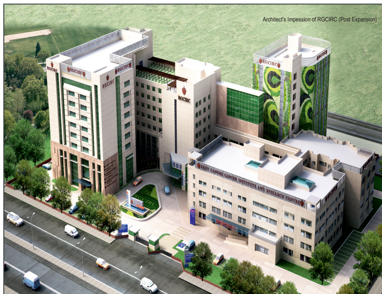
Architect's Impression of RGCIRC (Post Expansion)