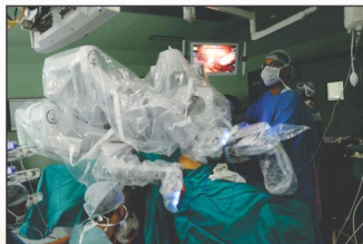
Fig2: The da Vinci robotic surgical system