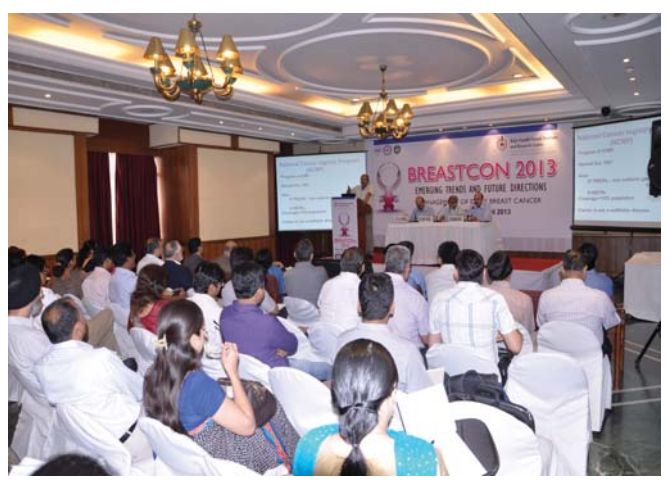
Scientific proceedings of BREASTCON- 2013)

consensus on the most burning issues in the purest of scientific spirit. The conference was tailored to cover recent advances in imaging, diagnostic dilemmas in insitu cancers, optimal imaging for screening, diagnosis andtreatmentplanning, role of genomic profiling techniques of breast conservation and reconstructive challenges, neoadjuvant strategies to optimize breast conservation, and adjuvant radiation and systemic therapy in the management of early breast cancer.