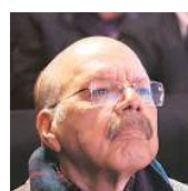
NASIM AHMAD ZAIDI , Former Chief Election Commissioner of India