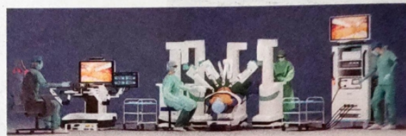
SSI Mantra 4 Arm System

Yes there is a lot of misplaced skepticism about robots or machines undertaking surgery instead of surgeons. In reality the robot follows the directions of the surgeon only.